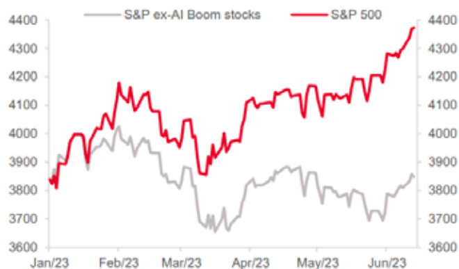
AI-related stocks drove virtually all S&P 500 returns this year

Data as of 14/06/2023.