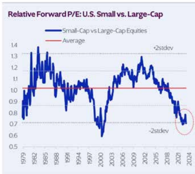
EXHIBIT 88: Small-Cap Stocks Remain Historically Cheap vs. Large-Cap Stocks, Trading at 20-Year Lows (-30% Below Long-Term Average)

Note: Valuation analysis excludes outliers and non-earners. Data as at April 30, 2023.